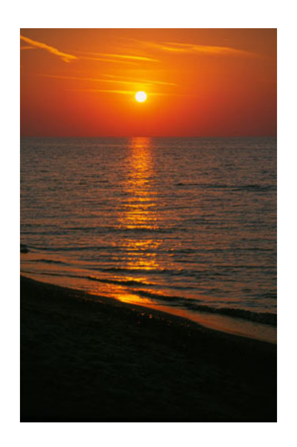
2006 City of New Meadows